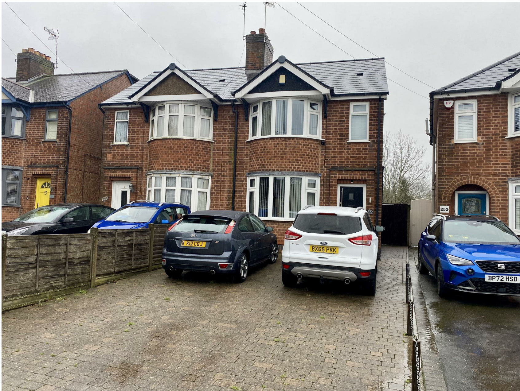
250 Coventry Road, Hinckley, LE10 0NG £269,950